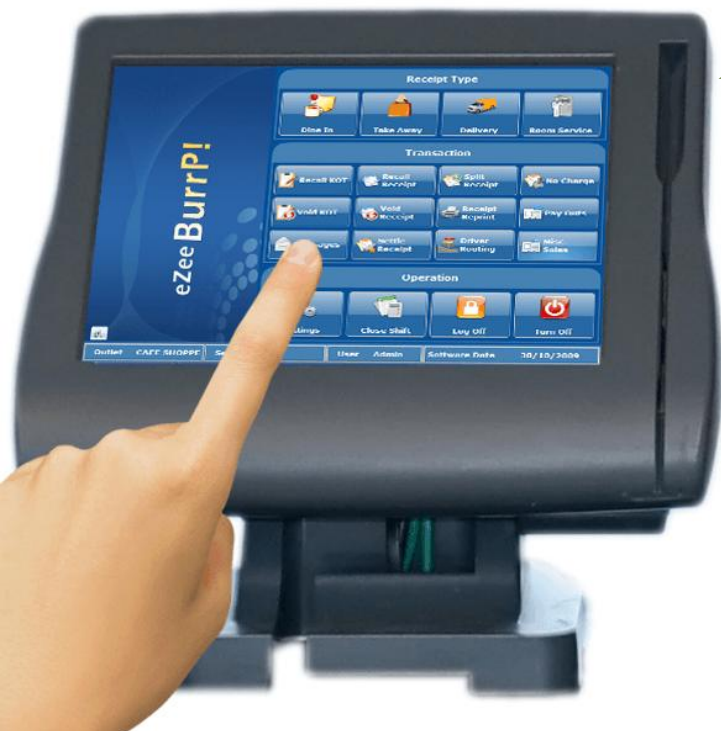
Embedded POS Machine